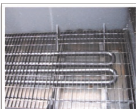
Heating coil and removable grates.