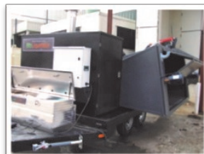
Tips hydraulically to facilitate loading with various loading equipment.