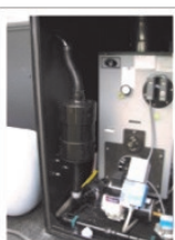
Efficient propane boiler.