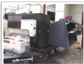
Tips hydraulically to facilitate loading with various loading equipment.