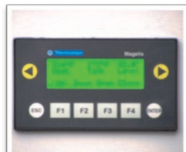
Simple controls and informative display.