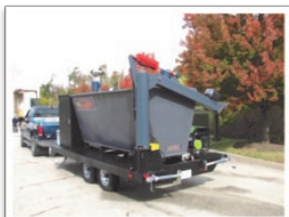
Easily pulled behind a half ton pickup truck.