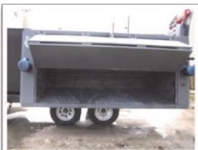
Easily cleaned when tipped.