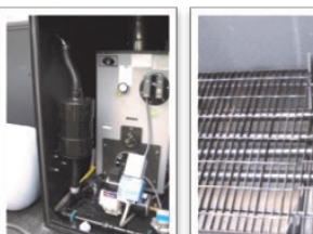
Efficient propane boiler.