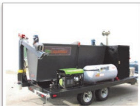
2500 pound mobile unit with crane option.